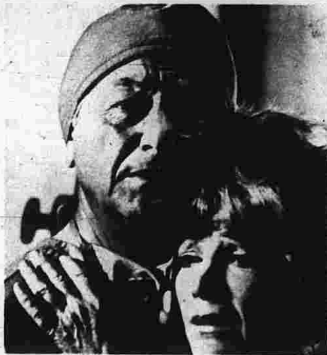
Robert Young and Anne Baxter, as his girl friend, on ABC's "Marcus Welby, M.D.," Tuesday 10-11 p.m.