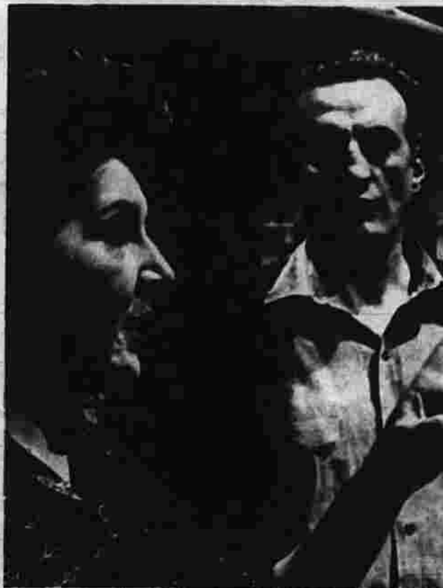
Maureen Stapleton and George C. Scott in "Mirror, Mirror, Off the Wall" Friday 10-11 p.m. on NBC.

Turn East from Main St. at State Theater on to Bissell