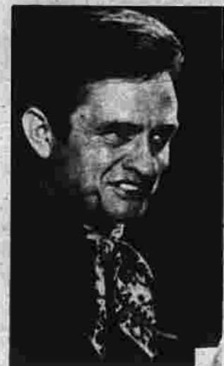
Johnny Cash sings on ABC's "This Is Tom Jones" Thursday 9-10 p.m.