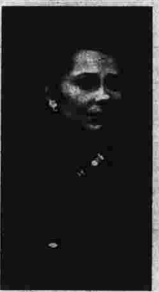
Elizabeth Ashley in "Hallmark Hall of Fame" drama, "The File of Devlin," Friday 8:30-10 p.m. on NBC.